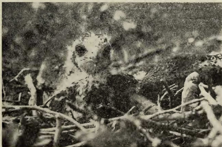
Figure 2. Sennett's White-tailed Hawk, age 30 days. Aransas Refuge, Texas May 10, 1941

Food and feeding habits. Bent (1937:220) states on the authority of various observers that "cotton rats, quails, snakes, lizards, frogs, grasshoppers and beetles" are eaten by this hawk in the United States. Cottam and Knappen (1939:150) analyzed four stomachs and found a variety of food items—mainly insects, snakes, and frogs. One stomach